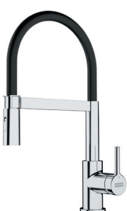
Product Code: 1150049 Finish: Black and Chrome Type: Semi Professional