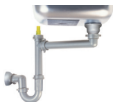
Spazi F/1 Single Bowl Product Code: 1120008

Franke Spazi plumbing kits are made from rigid grey polypropylene and are the ideal hygienic solution to a Franke sink waste system. Spazi plumbing kits have a manifold with an incline and an air vent for faster water disposal. The relevant plumbing kit is shown with each sink throughout this brochure.