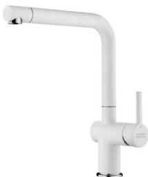
Product Code: 1150046 Finish: White Type: Swivel

Solid Brass Construction. Ceramic Disk Cartridge. Colour matched to Fraganite range. 180 Degree Spout Swivel. Water efficient 12L per minute flowrate. Connection dimension: DN 10. Connection type: G 3/8 " connection.