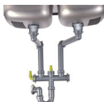
Spazi F/2 Double Bowl Product Code: 1120009