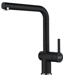
Product Code: 1150045 Finish: Black Type: Swivel