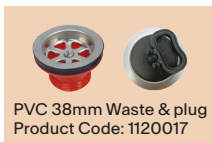
PVC 38mm Waste & plug Product Code: 1120017

PLEASE NOTE Drop-on sinks do not include Waste Fittings. 38mm waste fitting sold separately.