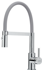
Product Code: 1150048 Finish: Grey and Chrome Type: Semi Professional

Solid Brass Construction. Ceramic Disk Cartridge. Colour matched to Franke coloured sink range. Water efficient 12L per minute flowrate. Connection dimension: DN 10. Connection type: G 3/8 " connection.